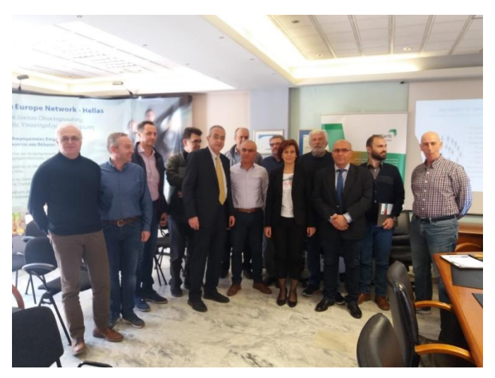
Regional Stakeholders' meeting – 16 April 2019, Kozni, Greece

During this semester, the DeCarb partners continue to carry out Regional Stakeholders' meetings in the project territories to exchange views, identify needs and build a sustainable collaboration.